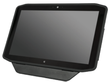
SlateMate Data Acquisition Mobile (Barcode Reader and High Frequency RFID)