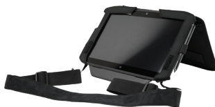
Work Anywhere Kit (case, shoulder strap, carry handle, screen cover)