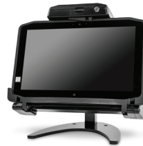
Secure Mobile Dock (for vehicle or desktop)